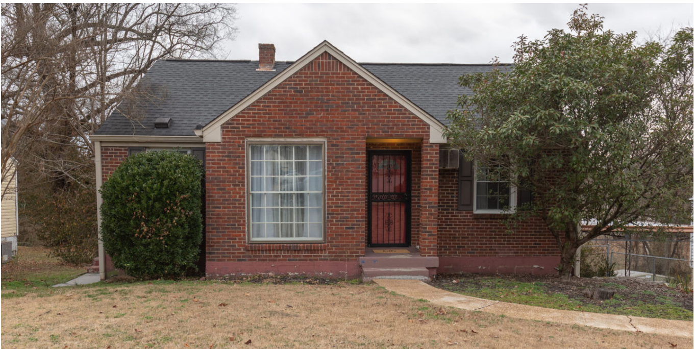
Apartment at Saturn Drive